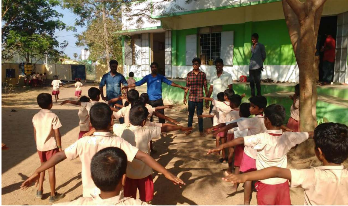
Sports Activities at Venkambakkam School