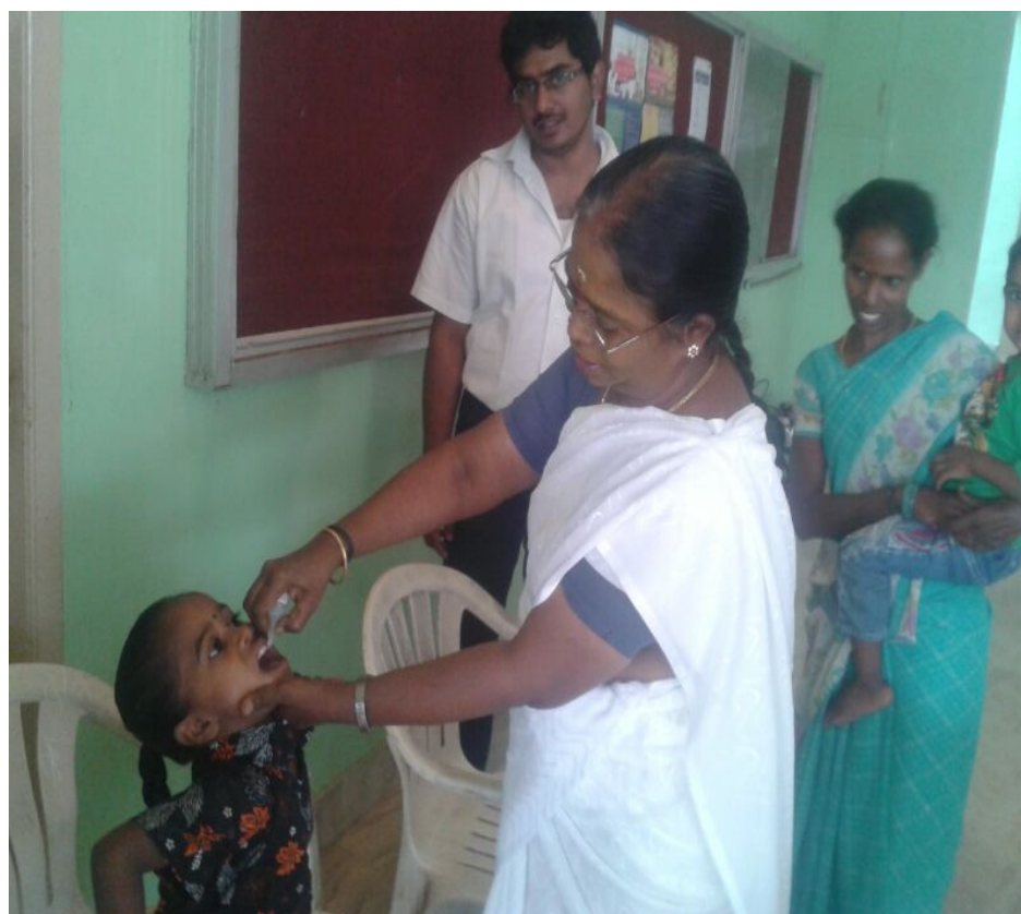
Polio Drops given to the child during the camp at Bharath University on 22 nd January 2016.