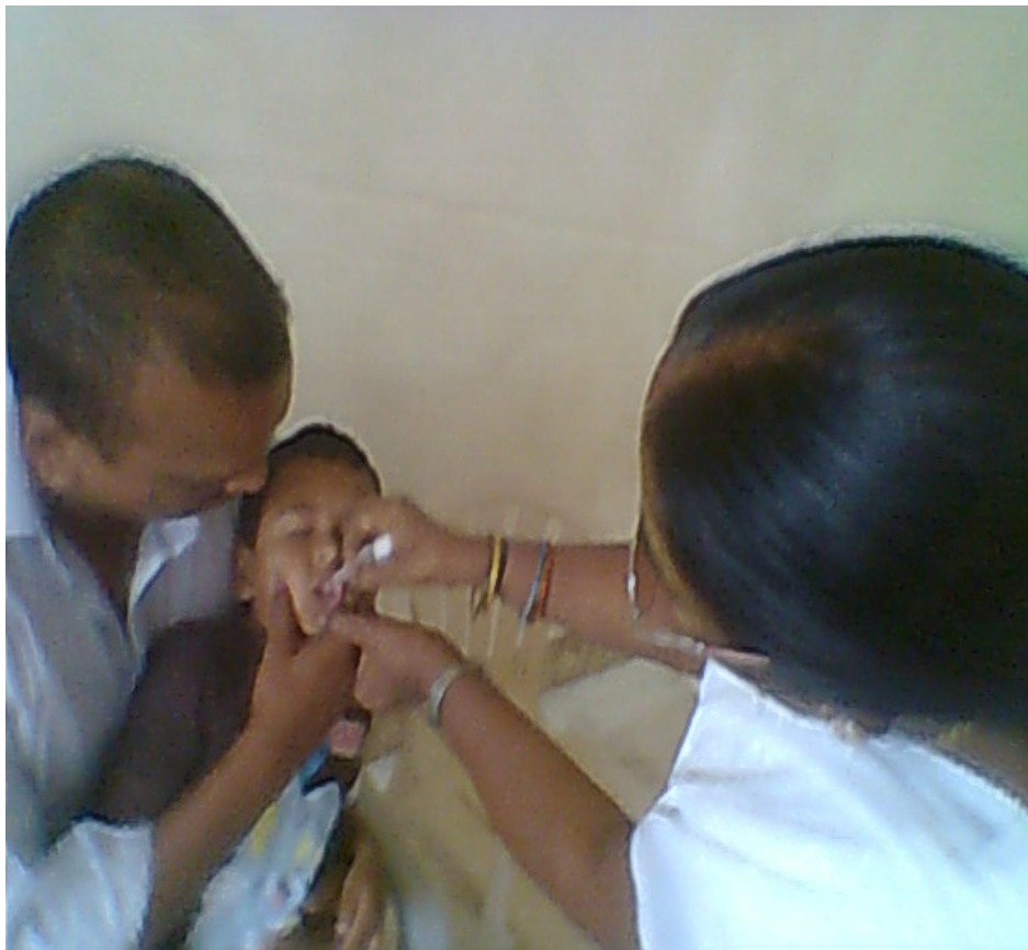
Polio drops camp was conducted at Bharath University on 22 nd January 2016. Polio Drops is given to the child during the camp.