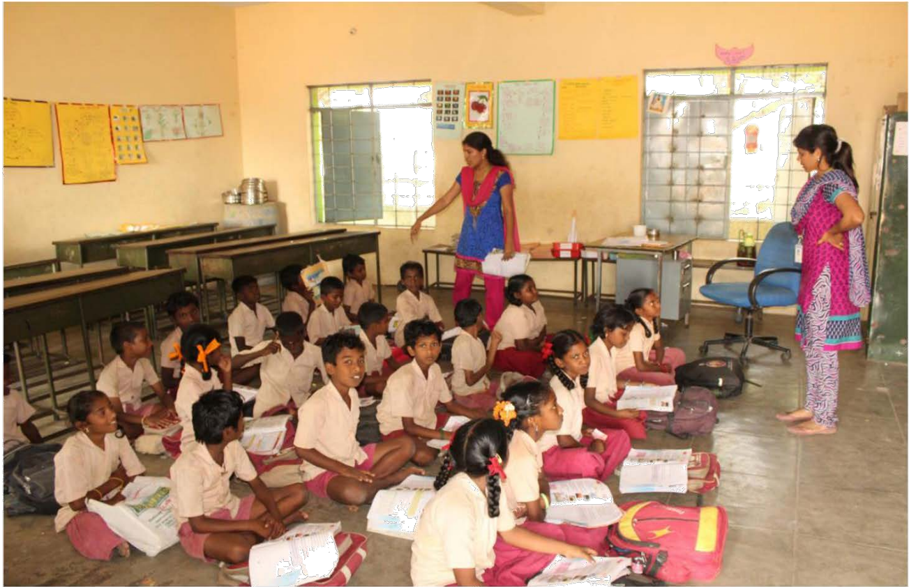
School Soft Skill Development Program at vengampakkam village,kanchipuram district