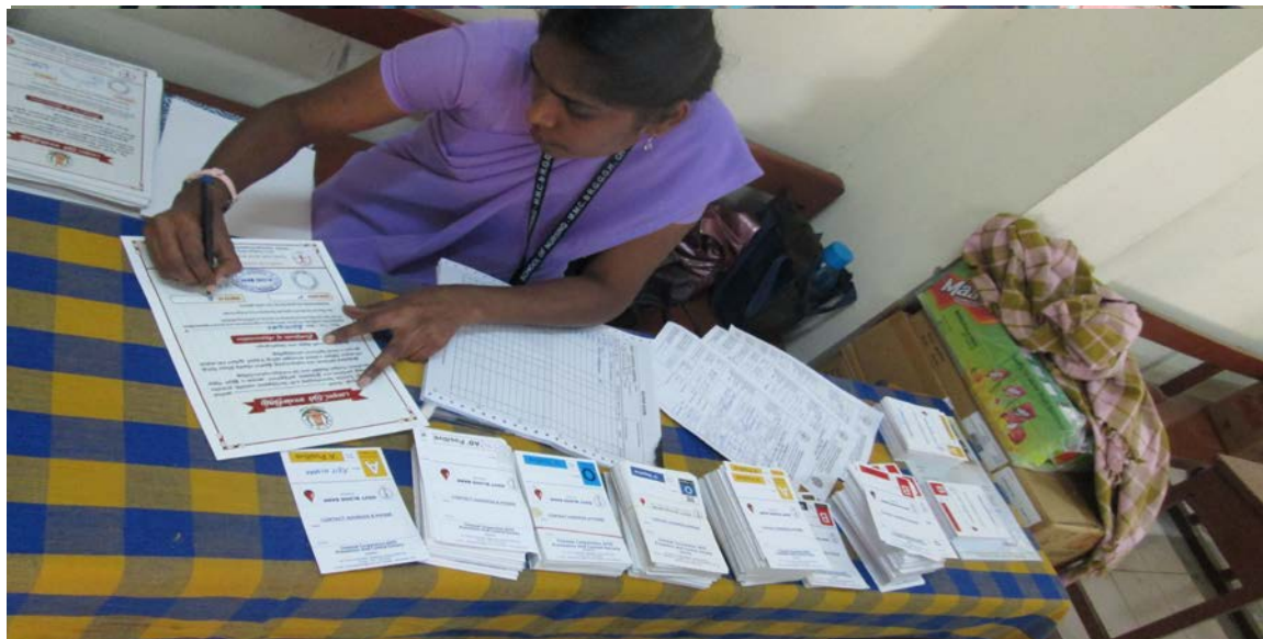
BLOOD DONATION CAMP was held at “BHARATH UNIVERSITY” on 29 th July 2015 "ACT AS IF WHAT YOU DO MAKES A DIFFERENCE. IT DOES."