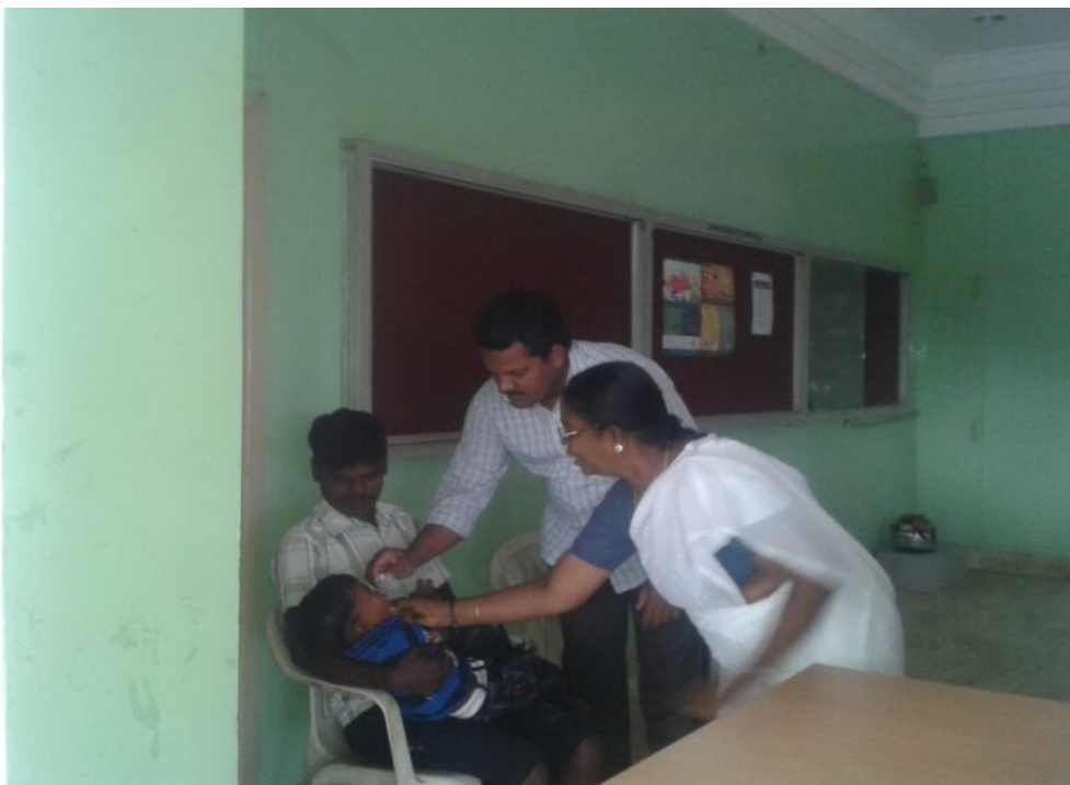
Parent waiting with Child during Polio Drops camp on 22 nd January 2016 at Bharath University.