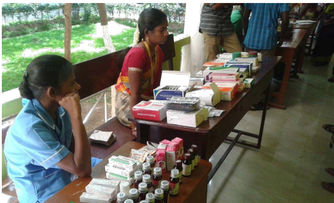
Distribution of Medicine at our University Campus on 13 th August 2015.