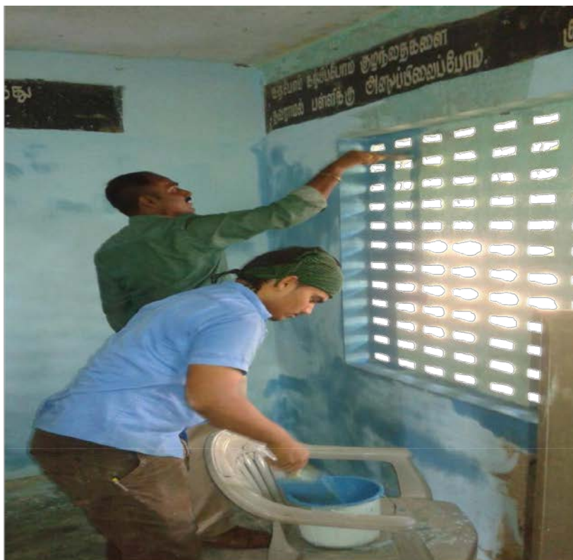
White Wash Primary School at Venkambakkam Villagekanchipuram district