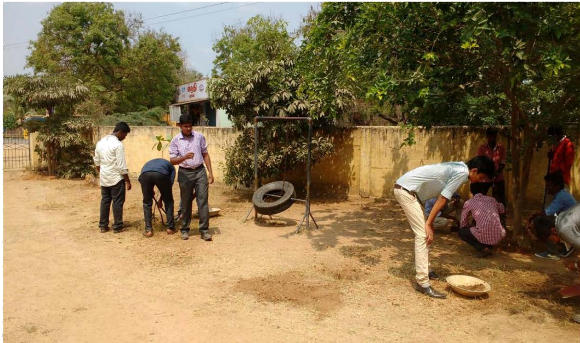
NSS volunteers cleaning the school campus during the Special Camp at vengampakkam On 20 th March 2016.