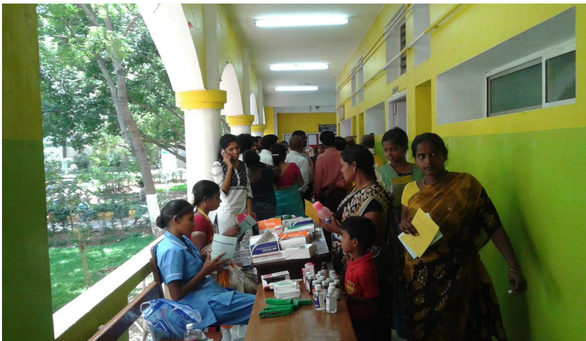
Village People are attended the free health camp at our university campus. on 13 th August 2015.