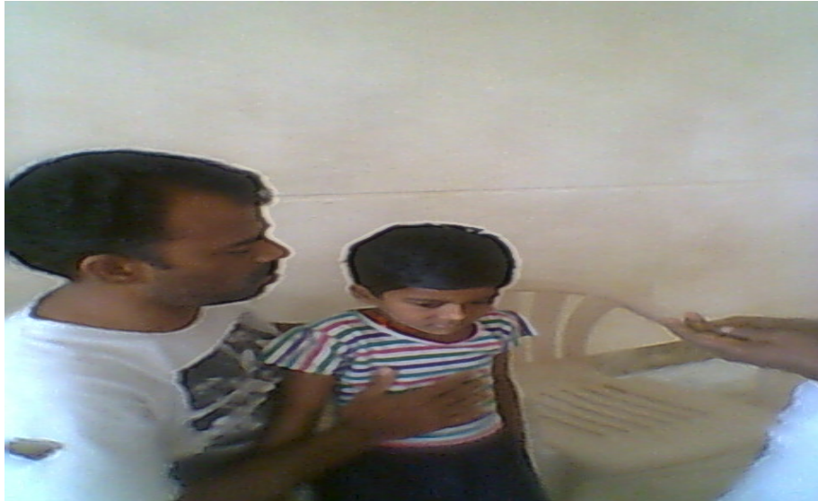
Polio drops camp was held at "BHARATH UNIVERSITY" on 22 nd January 2016.